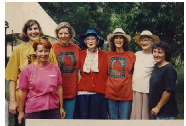
Past and present hard working girls of Conondale Range Committee