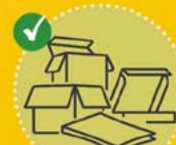
Clean paper and cardboard