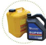
Engine oil (up to 20L), domestic customers only