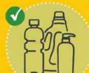
Plastic bottles and containers (empty)