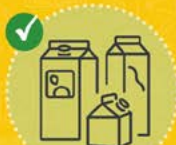
Juice and milk carton (empty)