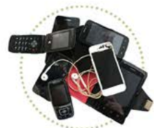
Mobile phones and accessories can now be recycled at council's waste facilities and libraries through a partnership with MobileMuster mobilemuster.com.au