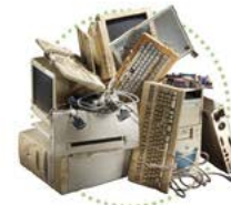
Electronic waste including printers, TVs, scanners, video game consoles, computers and computer peripherals.