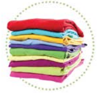
Clothing and cleaning rags (charity bin)