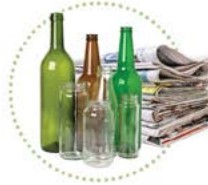
All items that are accepted in the yellow recycling bin