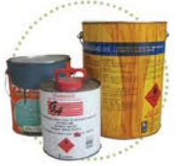
Agricultural and decorative paint (up to 100L) and domestic hazardous chemicals (up to 20L)