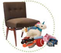
Can be sold via recycle markets such as furniture, toys and building materials