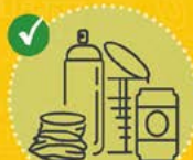
Metal cans, aerosols and crumpled foil (empty)