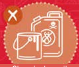
Chemicals - oil, pesticides, paints or solvents