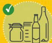
Glass bottles and jars (empty)