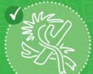
Small branches and palms cut into small 30cm pieces