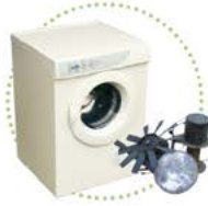
Metal objects such as roofing iron, exhausts and white goods