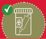
Must be enclosed in a rigid wall, puncture proof container