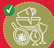
Crockery and mirrors